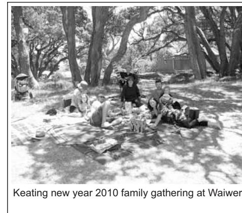
Keating new year 2010 family gathering at Waiwera